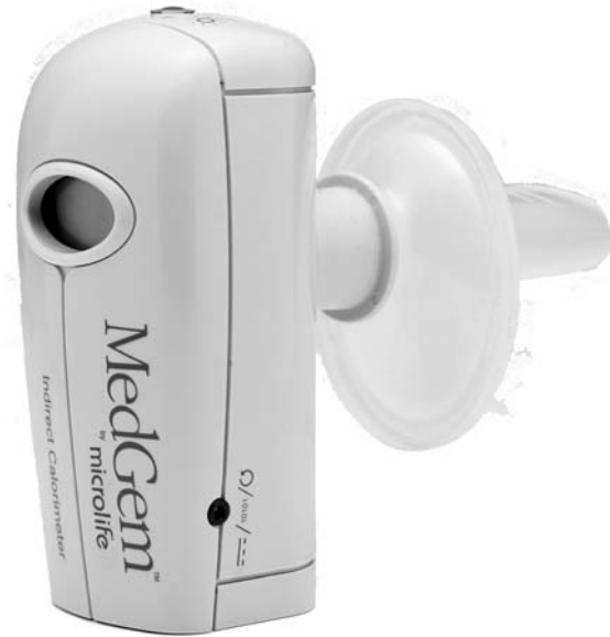
Figure 1 — Handheld indirect calorimeter (MedGem, Microlife, Inc., Golden, CO).

sensor. The principle operation is based on the deactivation of ruthenium in the presence of oxygen. When the active and reference ruthenium cells are excited by an internal light source, they fluoresce. This reaction is quenched by the presence of oxygen, and the amount of quenching is proportional to the concentration of oxygen. The volume of inspired and expired air is measured using ultrasonic sensing technology. There is a transducer at each end of the flow tube that emits sound pulses. The transmission time from the sending to the receiving transducer is increased or decreased in proportion to the rate and direction of gas flow. The Gem uses standard metabolic formulas to calculate oxygen uptake. RMR is calculated from oxygen consumption and a fixed respiratory quotient (RQ) of 0.85 using a modified de Weir equation (8).